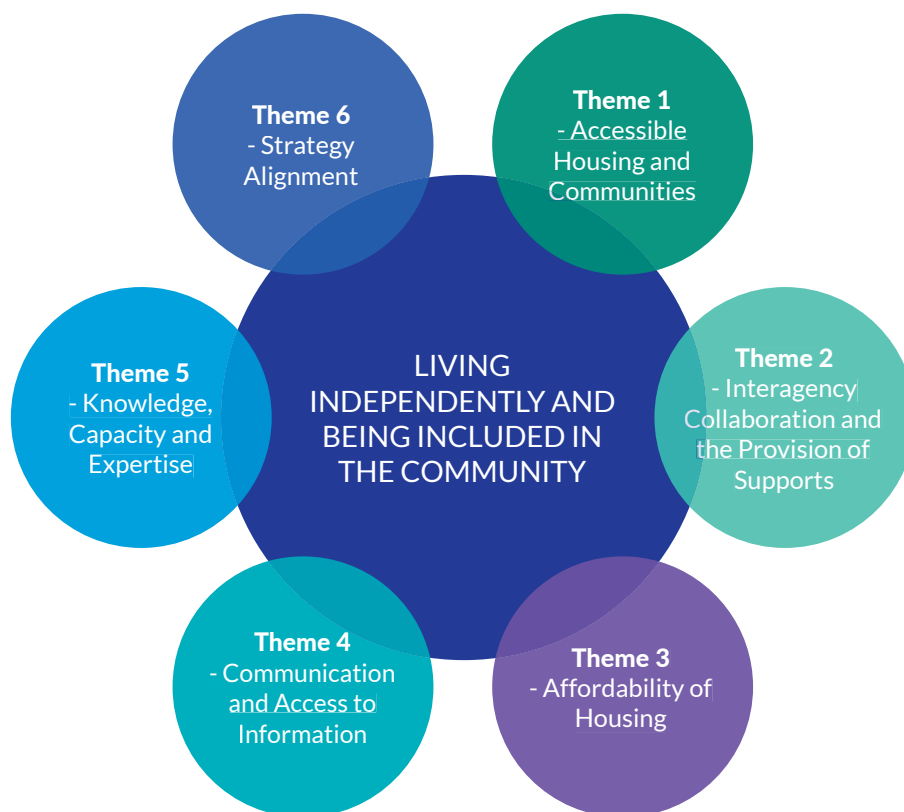
Figure 4: Strategy Themes

The overarching vision of the Strategy, driven by the feedback to the consultation is to facilitate independent living. The themes below that have been developed are a result of the refinement of the feedback from the consultation process and contain the outcomes that are required to achieve this. The Implementation Plan that will be prepared and published by the end of Q2 2022 will contain the detail of how the outcomes can be achieved and progress monitored. However, the Strategy contains some initial actions that will be commenced ahead of the publication of the Implementation Plan. The inclusion of such actions shows the Government's intent to address the issues faced by disabled people accessing housing and to provide a clear signal to the stakeholders that action is required immediately.