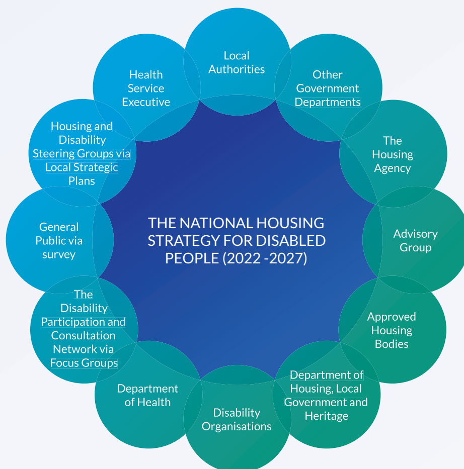
Figure 2: Contributors to the Development of the National Housing Strategy for Disabled People (2022 - 2027)