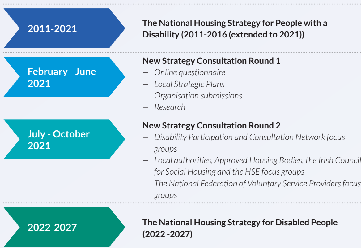
Figure 1: Timelines for Development of the National Housing Strategy for Disabled People 2022 - 2027