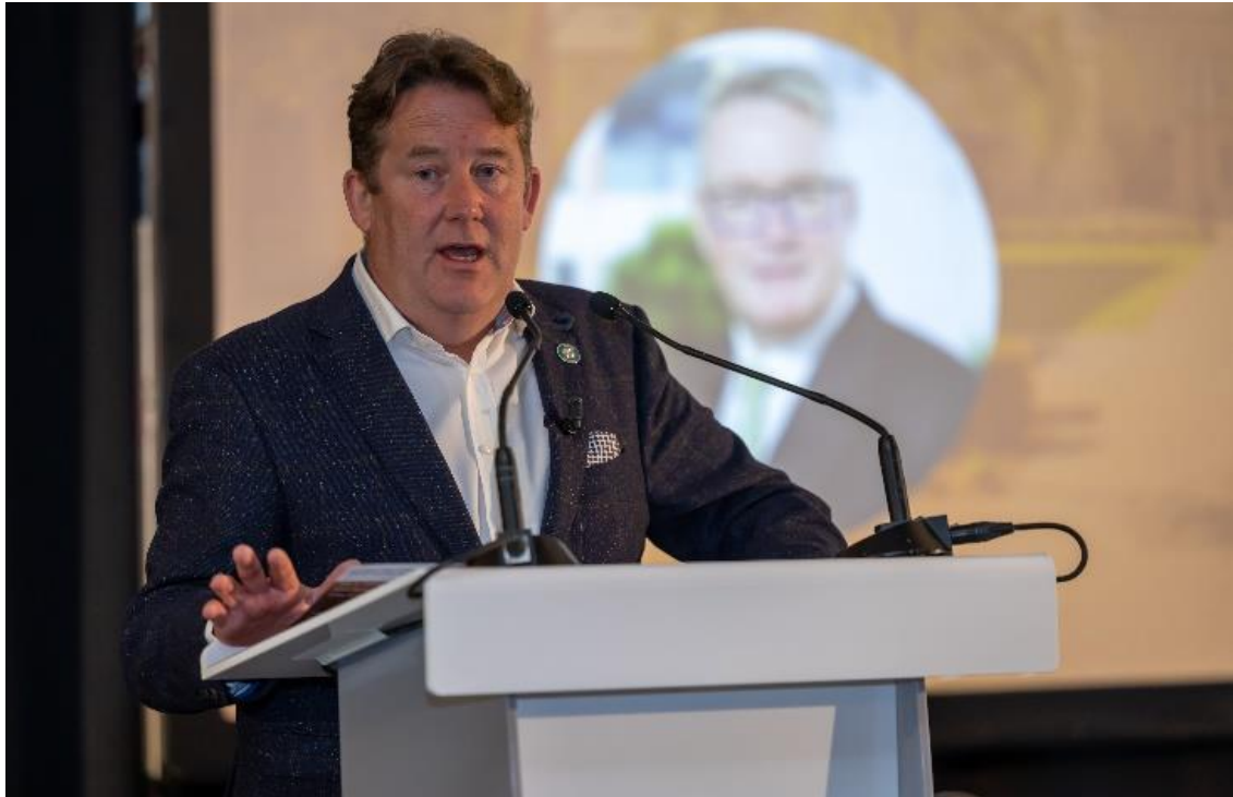
Darragh O'Brien, Minister for Housing, Local Government and Heritage

Minister O'Brien drew attention to the positive, problem-solving attitudes of Housing Agency staff. He acknowledged the complex context that all stakeholders are currently working in, recognising the existing challenges but encouraging all attendees to celebrate the positive impact they are having across the housing sector.