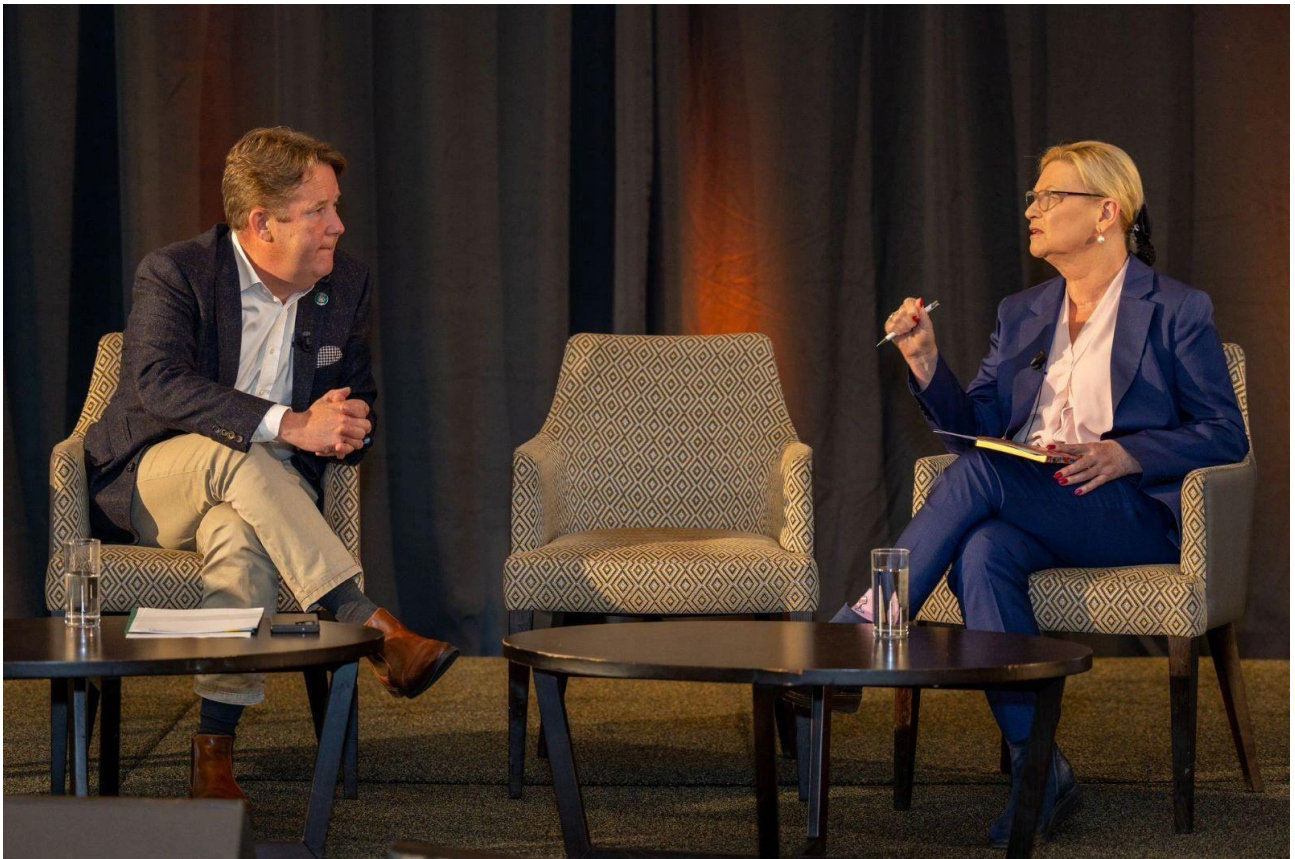
Darragh O'Brien and Eileen Dunne

The Minister's opening address was followed by a Q&A session between the Minister and Eileen Dunne, the former RTÉ newsreader. Eileen Dunne referenced the progress that is being made and the positivity she encountered amongst attendees. Issues around planning, funding, and homelessness were discussed, with Minister O'Brien stating that the latter is the single biggest concern for the Department. He respected that not everyone was feeling the progress that is being made, and that behind every figure was a family. The session concluded with Minister O'Brien asserting that the biggest focus for the government is on increasing supply and building a sustainable housing sector.